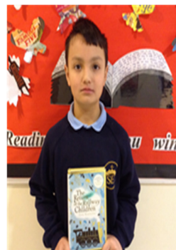
Return of the Railway Children.